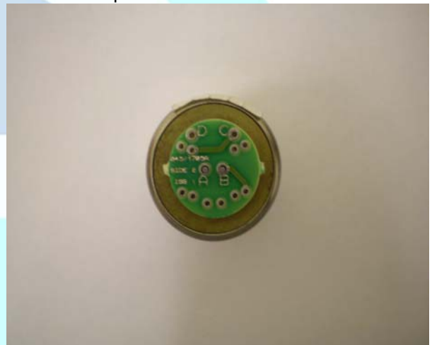
2. PCB on top.