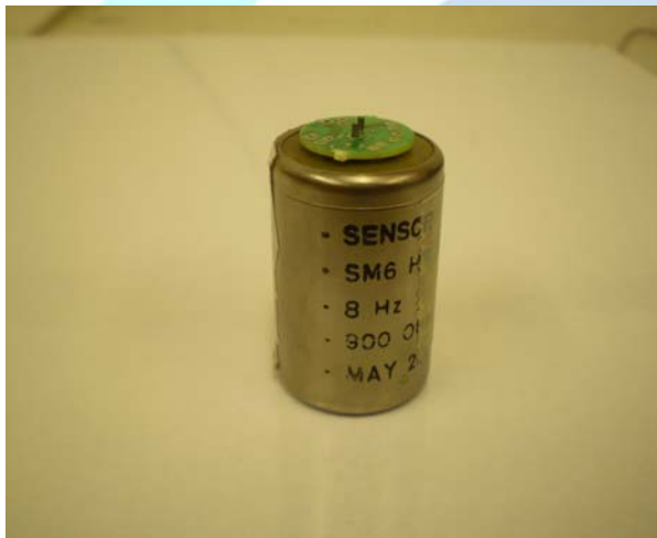
1. SM-6 Transducer Unit.