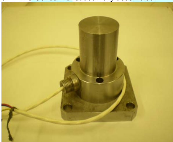
3. VEL/G Series Transducer fully assembled.