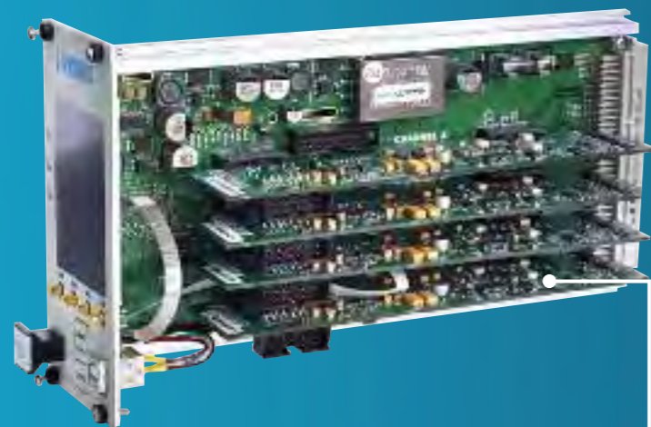
G3 4-channel Protection Module

USB Interface Utilised for uploading measurement algorithm code and settings