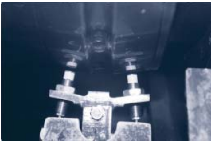
Probes monitoring differential expansion by observing a tapered collar

The linear measurement range of an eddy current probe is approximately one third of its coil diameter as shown earlier. The ideal flat target area for an eddy current probe to “observe” is twice the coil diameter. Therefore the ideal target size for an eddy current probe is six times the linear measurement range.